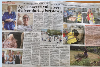
The Churchers Chefs who were amazing through the lockdown