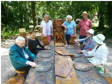
A few 'Mad Hatters' on our day trip to Bognor.

We've had a fantastic outings season with afternoon and day trips all over Hampshire and further afield. Work has started on next year's programme with new trips to include a canal boat trip, Arundel Castle, and a day trip to Warners. The programme is ready in the new year and will be on our website. Let us know if you would like to receive a copy.